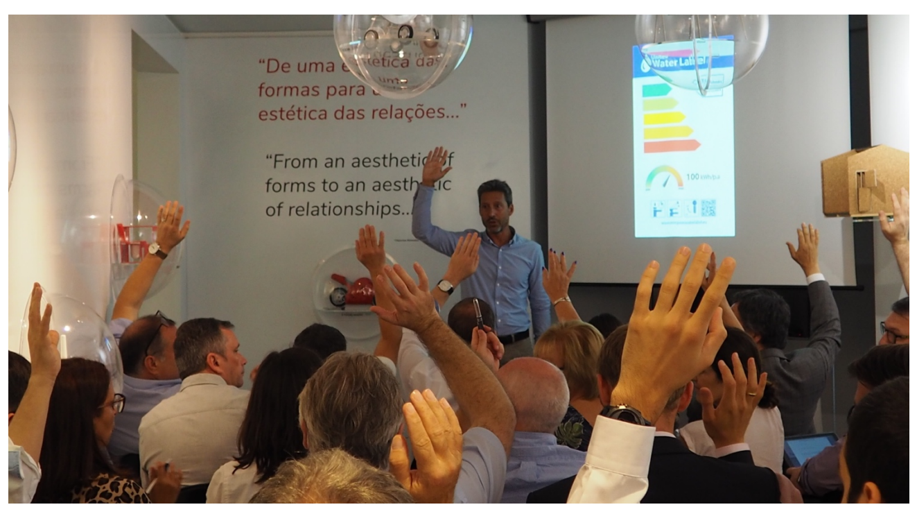
Voluntary agreement of the EBF on 5 July in Lisbon.

With more than 70 stakeholders of the bathroom sectorin attendance including manufacturers, brands, test labs, associations and independent consultants, the meeting led to the adoption of a single labelling scheme based on the proposals and contributions of the Swedish Energy Agency, the Swiss Energy, the ANQIP and the European Water Label. The scheme will be presented by the European Association for the Taps and Valves Industry (CEIR) to the European Commission for its subsequent approval as part of a proposal for a Voluntary Agreement. This represents an important step forward for the joint work of the European Bathroom Industry and their sustainability policies.